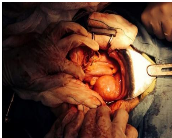
Fig.2. Intraoperative image demonstrating bilateral tubo-ovarian abscess superimposed on bilateral endometrioma. Both abscesses were successfully drained and removed.

87×102 mm and a left cyst of about 40 mm in diameter in favor of tubo-ovarian abscess.